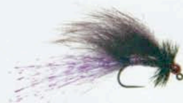
Mini Zonker Jig Purple