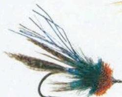
Mr. Blue Muddler