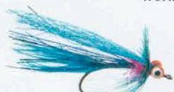
Electric Blue Comet